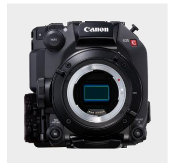
EOS C300 Mk III