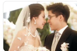
Live Wedding Broadcasting