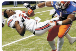
Live Sports Events