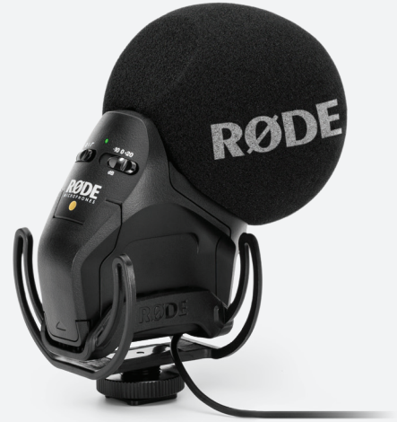
Stereo VideoMic Pro