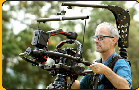
EasyTilt - Fits 25 & 30 mm