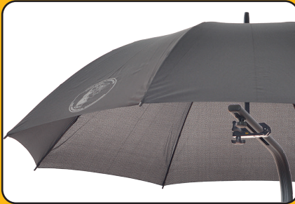
Umbrella with holder