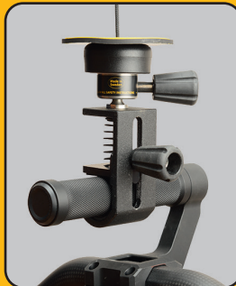
Hook with ball stud