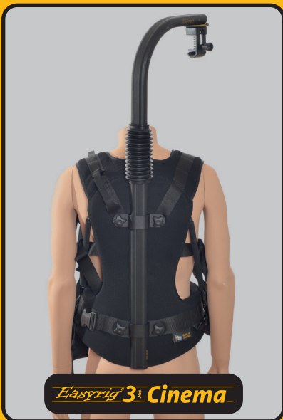
Easyrig 3 Cinema